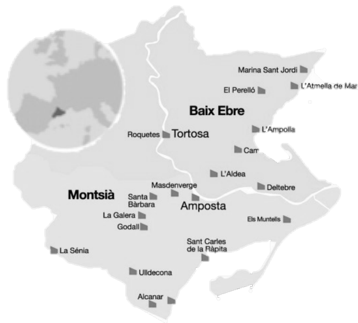
Figure 1: Map of the Lower Ebro Region

This paper analyses social conflicts in southern Catalonia, specifically the regions of Lower Ebro and Montsià, both located on the mouth of the Ebro River in the province of Tarragona [Figure 1]. 4 These conflicts were carried out by rural wage workers and proletarianized small farmers who were able to resist and to challenge almost permanently the Francoist agents in the region and, as we shall see, they had a direct impact on weakening the local powers of the dictatorship. Apparently calm, the peasantry was, however, suffering the unwelcome consequences of the so-called developmentalist political economy of the 1960s: impoverishment, proletarianization, higher taxation, the necessity to migrate, etc. This led to conflicts not primarily centred on the property of land itself, but on control of the means of production and the final product of the peasants' labour. Franco's Nuevo Estado (New State) claimed to be the guarantor of "social peace" so strictly labour conflicts necessarily became larger political struggles, as the latter were defined as crimes in Francoist Spain. Thereby,