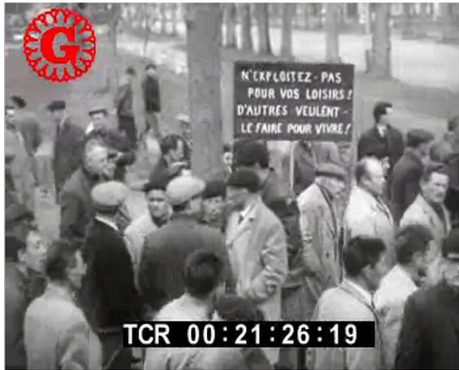
Still photograph from Gaumont News during the Gabin affair trial 14 – November 1964

However cleverly orchestrated, the media exposure was only the tip of the iceberg. A deep and increasing exasperation, reflecting the difficulties in recovering land, could be observed across many French regions, particularly in the West of the country. In these regions where sharecropping was dominant, the real core of the issue was not so much land ownership as land use. The “Duval-Lemmonier” affair was a perfect demonstration of this. As with the Gabin case, farmers invaded the home of a landowner. Having just acquired a grazing pasture, he had not renewed the lease of the tenant who worked/exploited it. Contacted by telephone, the landowner refused to change his decision. The intruders caused major damage. This incident was but one among a string of mobilizations which shook the departments of Manche and Orne from the winter of 1961-1962 onwards. In this particular case, the tensions were crystallized by the practice of “ bannies ” which were the annual allocation of pastures. The uncertainty created by this annual cycle jeopardized the increase in farmed surfaces so necessary to the expansion or creation of farms. 15 Faced with